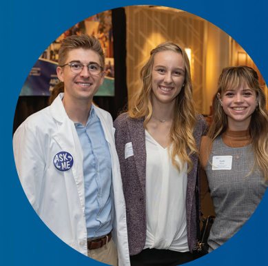
ARCS Scholars at the Annual Luncheon.